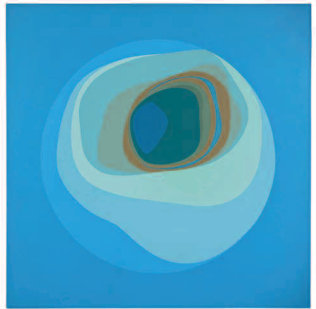
Blue Planet, 1965